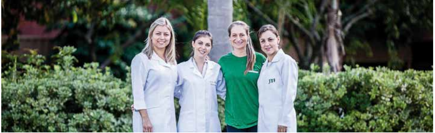
Health and well-being team in Brazil

Group-wide, we have a uniform understanding of the importance of health and safety, and this is reflected in individual policies within our business units that are tailored to specific business needs. Although each business has its own policy, there are a number of common factors to our approach, including maintaining effective management systems, using systematic risk assessments to identify workplace risks, and investing in continual performance improvement.